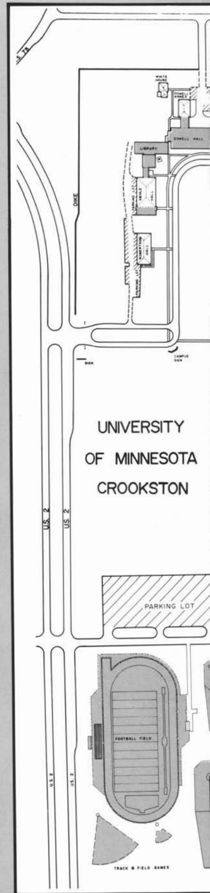
The college map attests to the buildings and facilities Provost Sahlstrom is responsible for. Shaded areas indicate additions since 1965.

With much love, we take joy in presenting this expression of our thanks for all you mean to us.