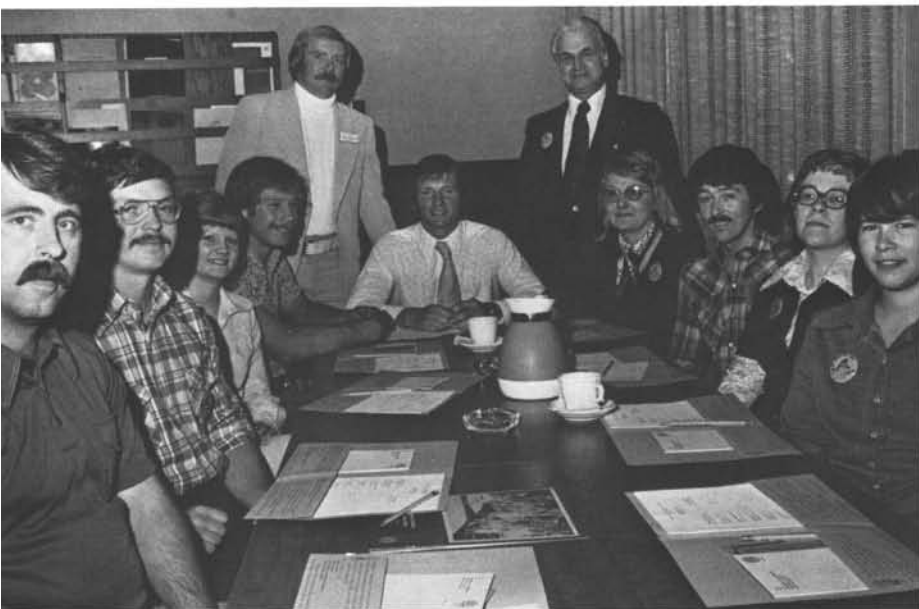
The alumni board held a meeting on Saturday morning.