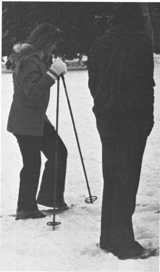
A demonstration by the Ski Club.

At the Student Activities Fair in October.