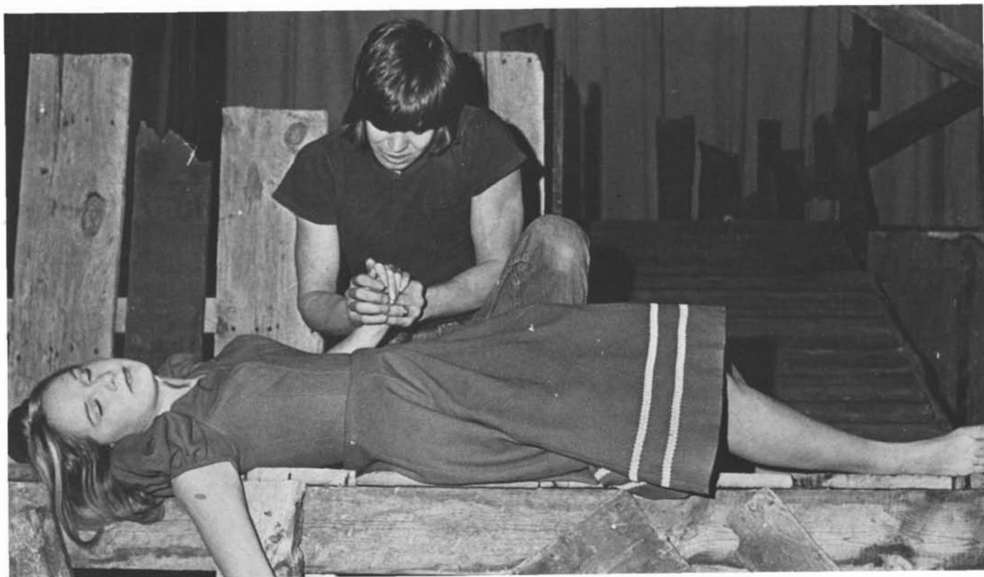
"Dark of the Moon", a play based on the Ballad of Barbra Allen, was presented Winter Quarter.

Final production of the year was "Last of the Red Hot Lovers", a play by Neil Simon. The action centered around a married man looking for excitement through extramarital affairs. His three attempts at finding a lover put him in some ridiculous situations and made for humorous entertainment.