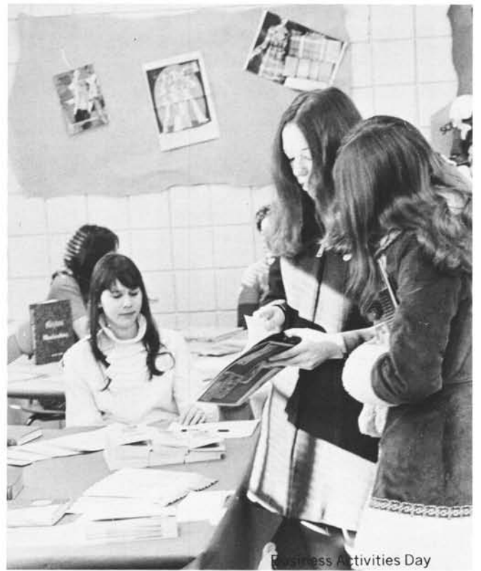
Business Activities Day