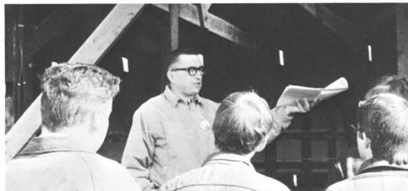
A visit to the Morris campus facilities gave these men another slant on livestock care and appraisal.