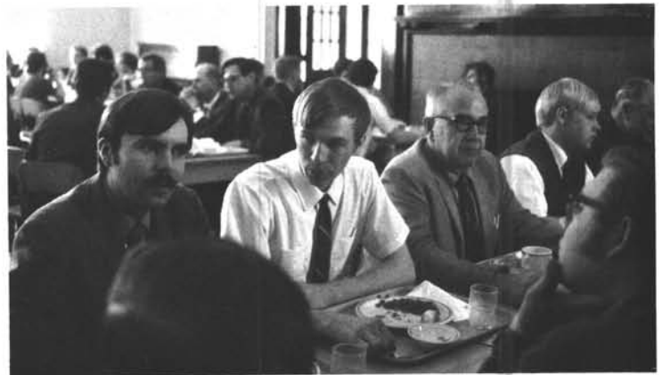
Students met at luncheon with the Ag Advisory Committee for the college in April.