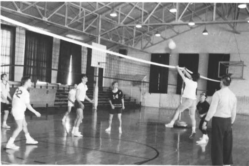
Fun and skill with the volleyball in a boys' phys ed class. This is called toning up and trimming down.