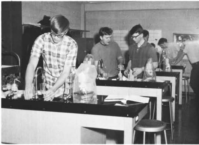
A biology class cleans up after sauerkraut!