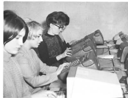
Future secretaries and calculators!