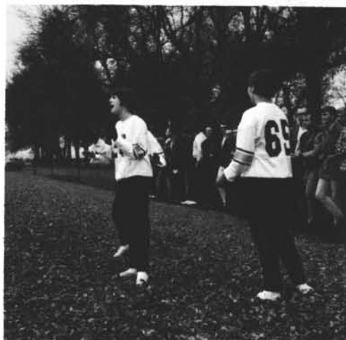
They tried very hard but it was not enough. The TROJANS lost by 7 points.