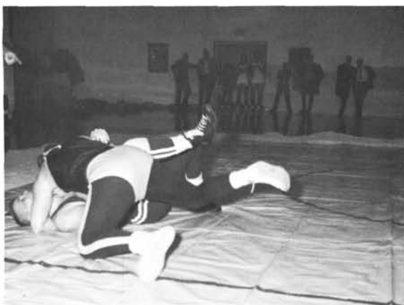
A Minnesota Tech "grappler" tries to pin his opponent.