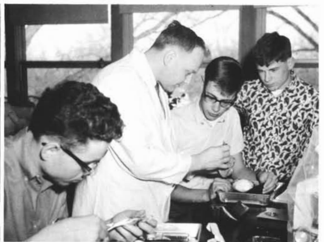
Biology students dissect clams in lab.