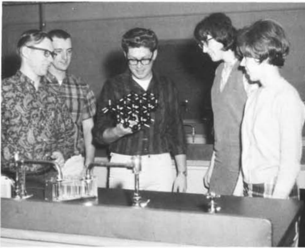
It's a what?