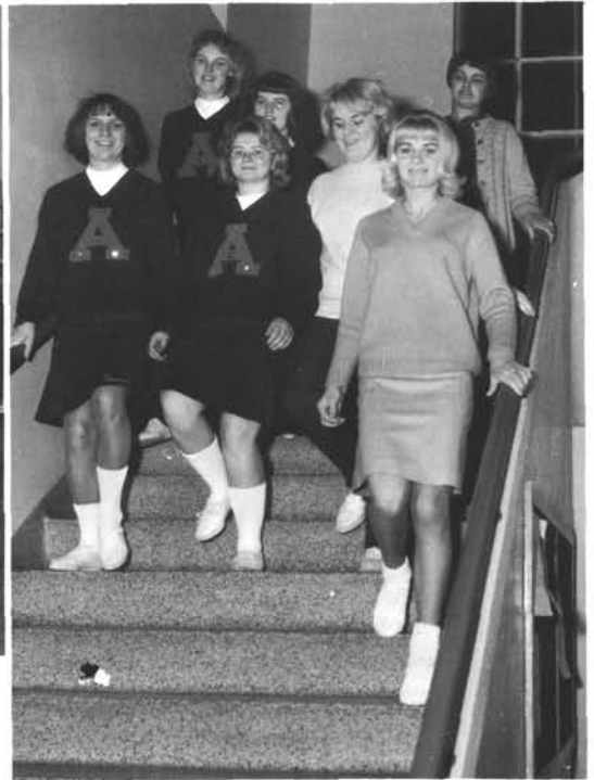
Senior G. A. A. members exit after their last meeting.