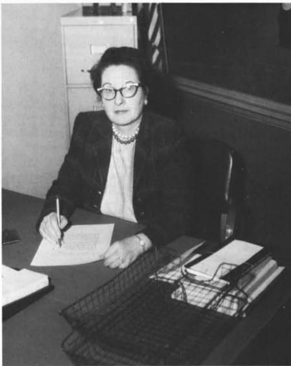
One of the most difficult tasks of a teacher is to correct the papers.