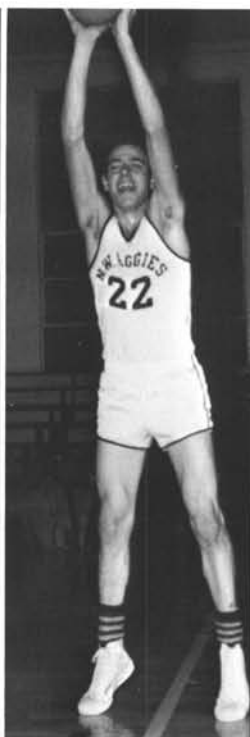
Danny Stahn Center