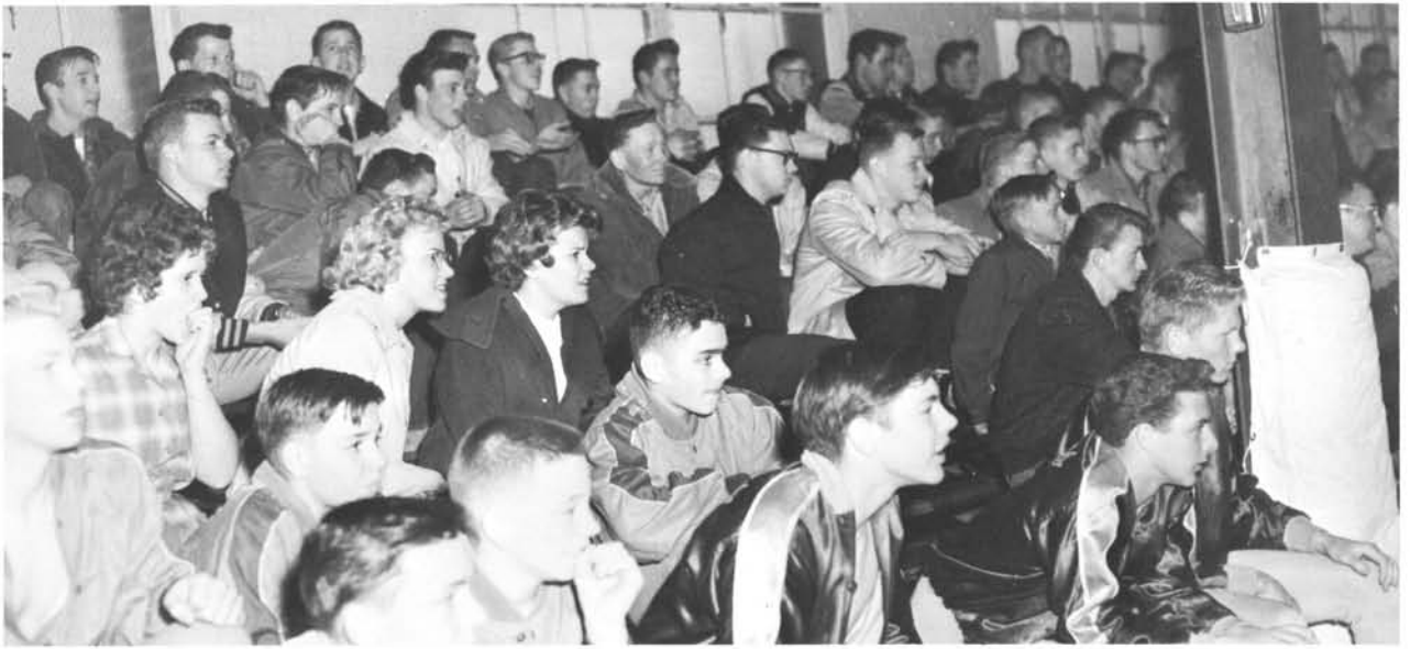
Even though the wrestler has to face his opponent alone, there is plenty of team spirit. You can almost hear the team members giving advice and encouragement.