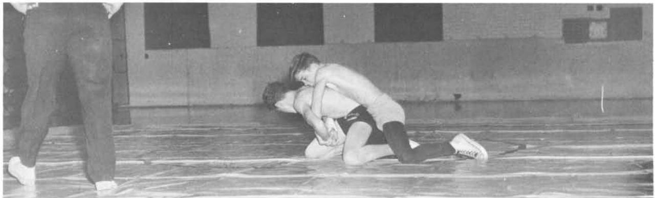
Sometimes the problem doesn't lie in pinning your man, it's a tough enough job just getting him off of your back so he doesn't pin you.