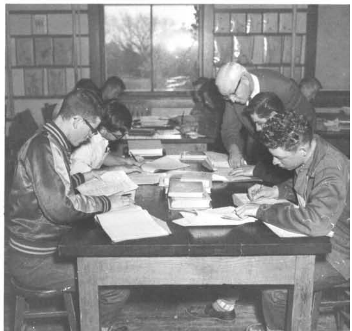
Oh—for the life of a modern farmer!!