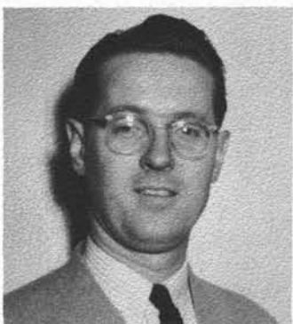
BRUCE C. BERESFORD