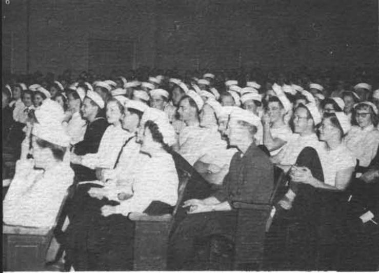
Drifting and Dreaming