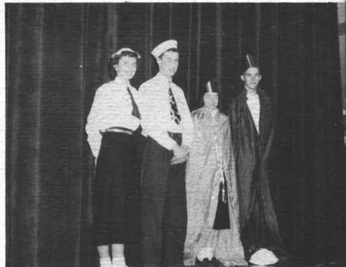
King and Queen for a day.