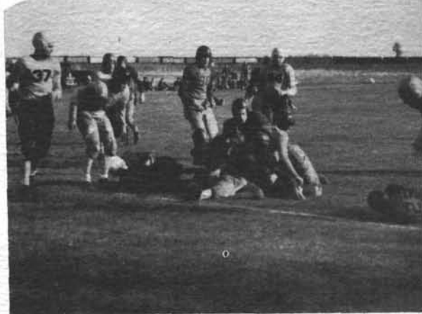
"Pick 'em up—lay 'em down!"