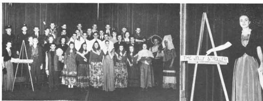
The entire cast for Variety Night