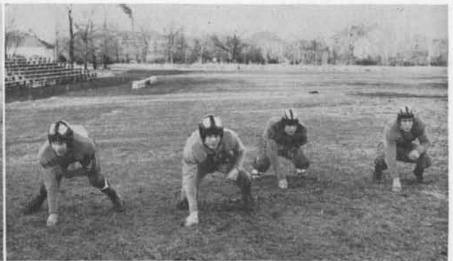
The first string backfield