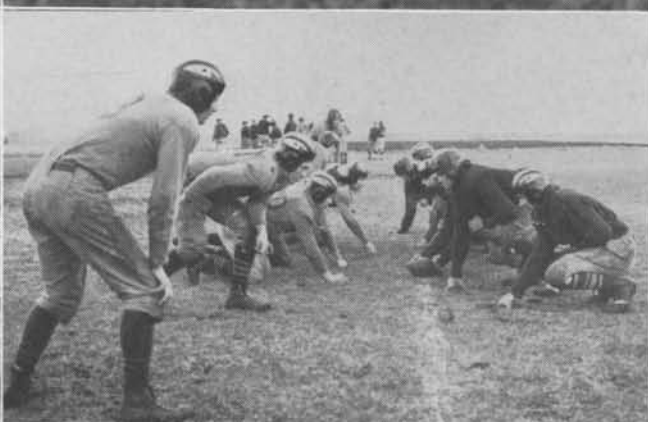
Daily practices and scrimmage kept the footballers pepped up