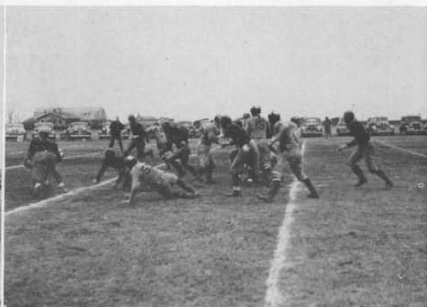
This time the tables are turned— Morris Aggies gain 7 yards.