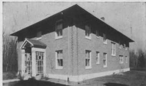
Campus Health Service