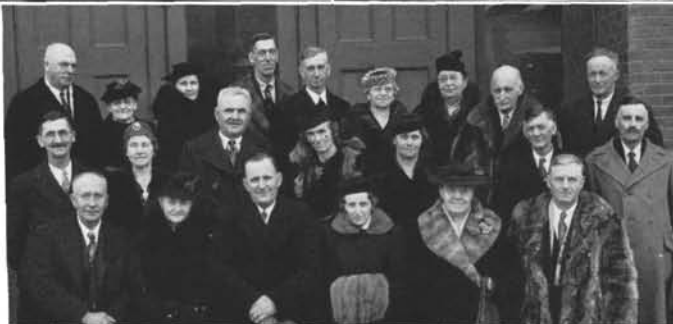
Outstanding Farmers and Homemakers in Red River Valley