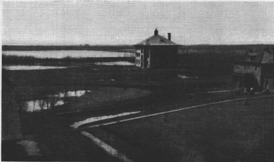
THE SCHOOL IN 1906