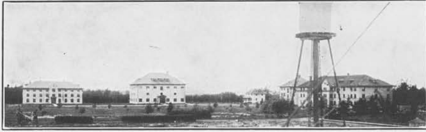
THE CAMPUS IN 1911