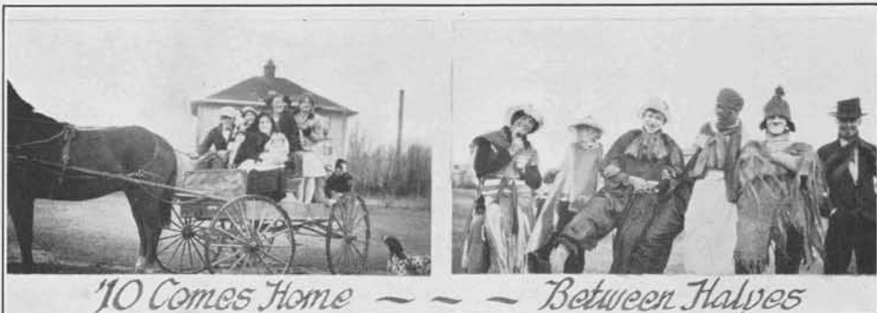
'10 Comes Home ~ ~ ~ Between Halves

At six o'clock everyone gathered at the dining hall for the annual Homecoming banquet. Talks were made by the captain and coach of each team. A dance and party followed the banquet which ended the entertainment for a day thoroughly enjoyed by everybody.