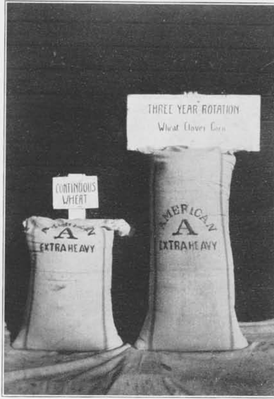
WHEAT GROWN CONTINUOUSLY AND IN ROTATION

our seasons 10,600 bushels of purebred seed grain and 450 bushels of seed corn have been distributed among the farmers of Northwestern Minnesota and 384 growers have cooperated by growing these seeds and selling them to their neighbors.