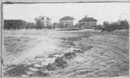
"BREAK, BREAK, BREAK,"