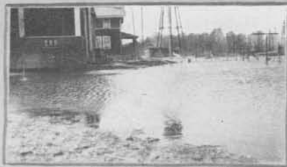
"Oh ruthless sea!"