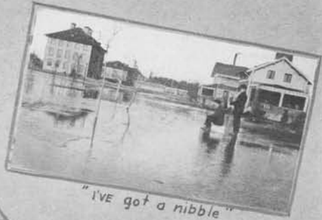
"I've got a nibble"