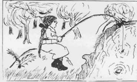
Ida Lanager stands for peace and happiness. This she seeks along the Red Lake River.