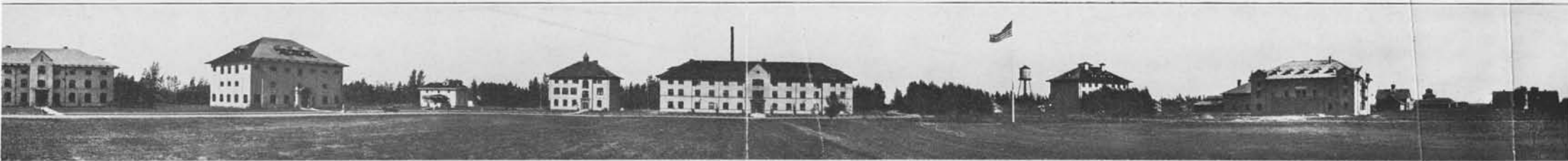
View of School Buildings 1915